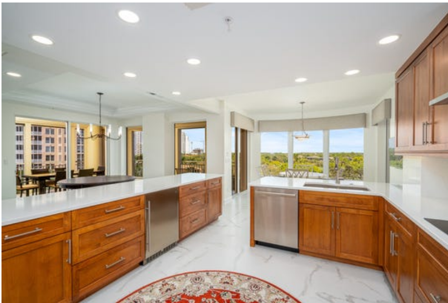
Vistas high-rise condominium remodel in Bonita Bay.

ADVERTISING & INTEGRATED MARKETING, Special to Naples Daily News Published 6:00 a.m. ET April 3, 2021